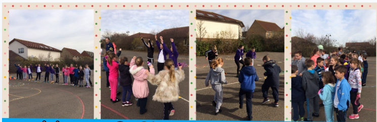
Year 2 Skipping Festival

On Tuesday 8th March 2016, we hosted a Year 2 Skipping Festival which was supported by our Year 6 Leaders. Children from Oakfield school joined up with Abacus to take part in a range of skipping and multi-sport activities which were run by Year 6. Great fun was had by the Year 2 children and even the sun came out to warm them up a bit. Our leaders really stepped up and showed great leadership skills on the morning and were a credit to our school