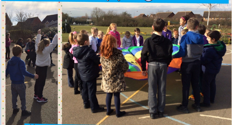
Abacus Primary School and Oakfield Primary School